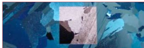
Removal of SiN layer from silicon wafer