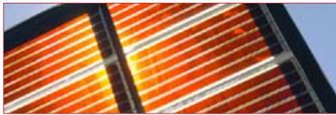
Panel of Dyesol cells

08:15 - 09:00 Registration and refreshments