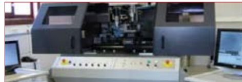
Excimer workstation with twin beam delivery